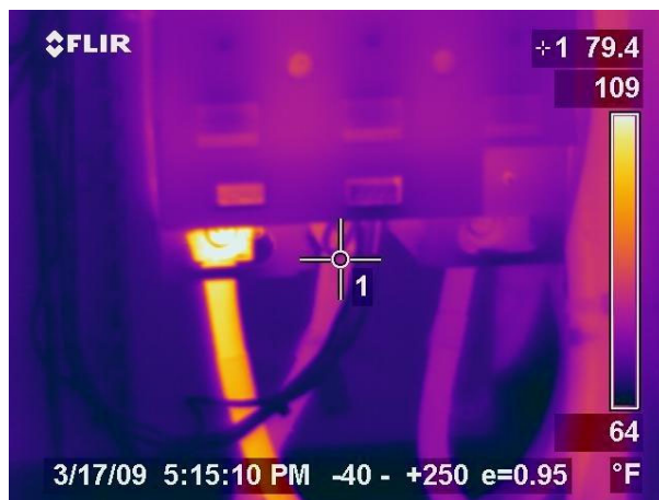
Figure 8: Infrared photo showing overheating wire

Electrical components mounted to air coolers should be inspected annually. Look for loose connectors or signs of overheating, such as black marks, melting of wire insulation, or cracks in wire insulation. Visually inspect the electrical connectors and use an infrared camera to look for overheating components. Any electrical issues, if left uncorrected, could result in a fire. Contact a company electrician or an electrical contractor to either repair or replace defective equipment.