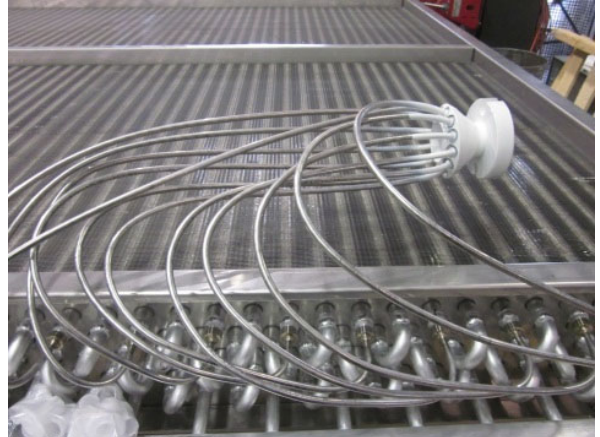
Figure 5: Typical distributor tube assembly

Some air coolers are equipped with refrigerant distributor devices that meter equal amounts of liquid and vapor refrigerant to each coil circuit. The distributors are commonly connected to each coil circuit by means of long, small diameter feed tubes, usually about 1/4" in diameter. It is important to periodically check these feed tubes for signs of rubbing. This will typically show up as a flattened area on one or more distributor tubes. If not repaired, the rubbing could eventually wear through the tube wall, causing an ammonia leak. Visually inspect each tube paying close attention to those that are touching or close to touching. Contact the air cooler manufacturer or a refrigeration contractor to reorient the tubes, install wear sleeves, or replace the tubing.