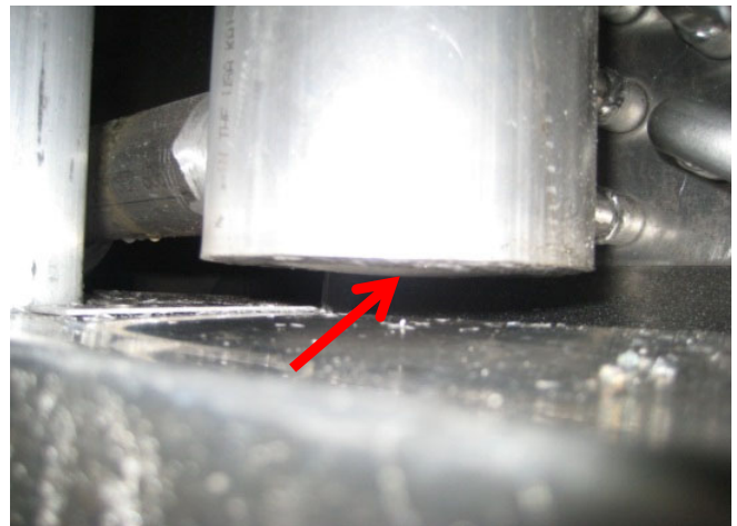
Figure 3: Bulged end cap on air cooler header

Inspect the ends of the evaporator header pipes for signs of bulging. The largest diameter end cap is typically the first location that any signs of over-pressurization will be evident. Tubes or pipes that look misshapen are also signs of over-pressurization. Trapped liquid in an air cooler could expand and cause the internal pressure to exceed the MAWP. This could result in ruptured components and ammonia leaks. Hydraulic shocking, or vapor propelled liquid, is another internal force that could exceed the air cooler's MAWP and cause ammonia leaks. Prevention measures include using good piping practices per the IIR Piping Handbook, keeping hot gas lines clear of liquid, and always allowing the defrost pressure to equalize before opening the suction stop valve.