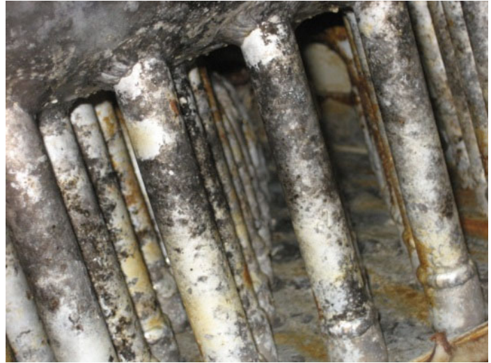
Figure 2: Corroded air cooler tubes

Inspect the surface of the tubes, fins, and piping connections for signs of pitting or uneven discoloration. Also inspect any insulated pipes where the vapor barrier might be compromised. Excessive pitting could result in an ammonia leak if the pit continues through the wall thickness of the tube or pipe. Corrosion of the fin surfaces results in reduced refrigeration capacity, so it is important to also check these surfaces. Visually inspect all areas of the coil with a flashlight. For hard to reach areas, use a flexible, lighted bore scope. If possible, measure the depth of large pits with a micrometer depth gauge.