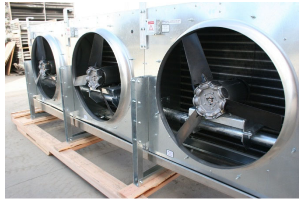
Figure 9: Air cooler with missing fan guards

The presence of and condition of fan guards should be inspected annually. In the absence of proper guarding, people could be injured or product could come into contact with moving fan blades. Visually inspect each air cooler to make sure that each fan is guarded and what condition each guard is in. Contact the equipment manufacturer to obtain replacement fan guards.