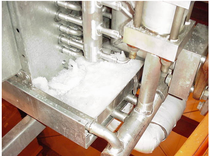
Figure 1: Ice accumulation in drain pan of hot gas defrosted air cooler

Inspect all air coolers for material buildup on the fins and drain pans. Dust and/or packaging material fibers are common sources for this build up. Inspect the air coolers operating in areas below freezing for excessive ice buildup on the fins and drain pans. Excessive ice and material buildup could interfere with air flow and reduce the coil capacity. Excessive ice buildup between the bottom of the coil tubes and the drain pan could cause mechanical damage to the coil tubes and drain pan. Remember that hot gas defrosted air coolers commonly have an array of heating tubes attached to the drain pan. Any damage to these tubes or to the tubes in the coil core could result in an ammonia leak. Follow the manufacturer's guidelines for defrosting air coolers, which might include adjusting the number of defrosts and their duration. Adjustment of the defrost regulator pressure setting may also be needed to ensure complete defrosting. If adjustments to the defrost scheme do not prevent excessive ice buildup, contact the air cooler manufacturer, a contractor, or a consultant for further analysis.