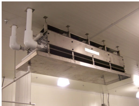
Figure 6: Ceiling suspended air cooler

The condition of the air cooler's housing and supports should be inspected annually. Visually inspect the unit housing and the hangers for cracks, missing or loose fasteners, and any signs of corrosion. Deteriorated supports could result in the unit falling from the mounting location, which could result in an ammonia leak. Also inspect piping supports near the air coolers. Typically, air coolers are not designed to support piping, control valves, or hand valves. Improperly supported piping could overstress the coil connections, resulting in a leak. Any unit and piping supports that show any signs of damage should be repaired or replaced immediately.