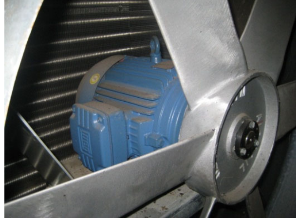
Figure 4: Typical air cooler axial fan assembly

The fan assemblies on air coolers should be inspected annually, or per the manufacturer's recommendation for your specific air coolers. With the fans running, look and listen for any vibrating components. Typically, vibration in larger sheet metal panels will be the most noticeable. Keeping a safe distance from the fan, and with all guards in place, watch the fan in operation, looking for any vibration as it rotates. Listen for any sudden changes in noise levels or tones. For variable frequency controlled fans, check for vibration over the entire range of speeds. For multi-fan units, shutdown individual fans to localize the source of vibration. With the fan motors off and safely locked out, check the torque on the bolts securing the fan assembly to the motor shaft. Also check the torque on the bolts holding the fan motor to its mount. Check with your air cooler manufacturer for proper bolt torque values. If left unchecked, loose fasteners in either the fan hub or the motor mount could result in a catastrophic failure such as mechanical damage to the air cooler tubes which could result in an ammonia leak.