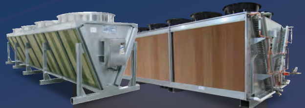
Fluid Coolers and Condensers