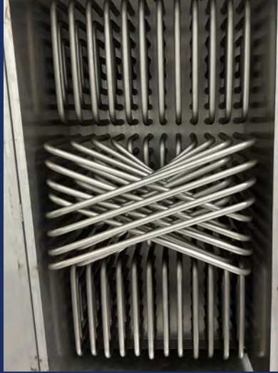
Custom circuiting: 48 feet 6 pass -Stainless steel materials