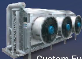
Custom Evaporators and Blast Freezers