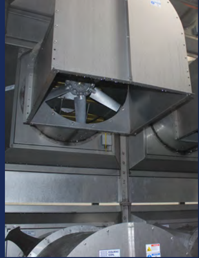
Defrost Hoods that trap defrost heat to shorten defrost cycle