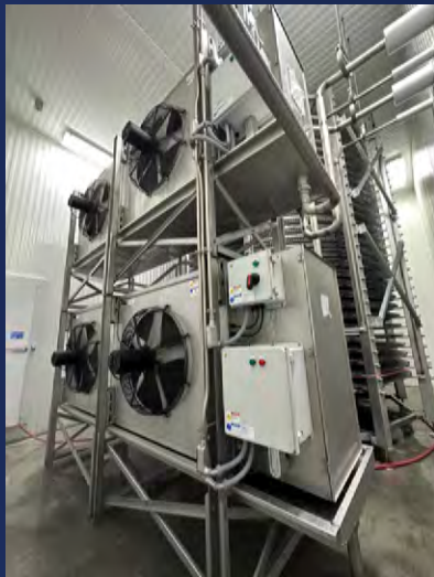
Washdown duty motors