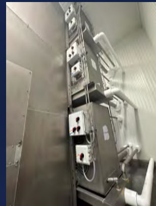
Factory wired UL listed panel, motors wired to individual disconnect.