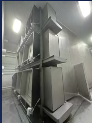
Three individual evaporators allow sequential defrost