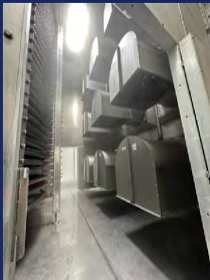
Fan tubes are tilted at a slight angle to increase air intake