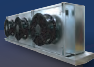
A+Series® Air Coolers