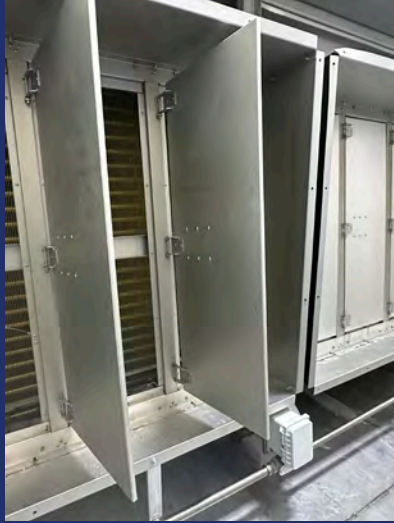
Louvers automatically close during defrost cycle – Epoxy coated fin material