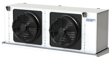
A+E Industrial Quality for Commercial Applications