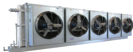
A+L High Profile