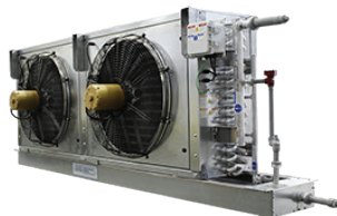
A+S Low Profile