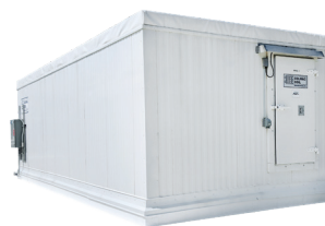
A+P Penthouse Unit