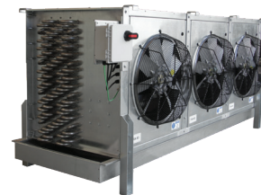
A+M Medium Profile