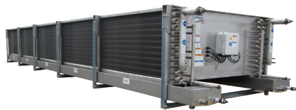
A+D Low Profile Dual Discharge