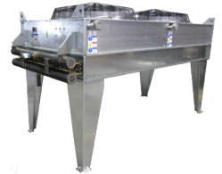
Air Cooled Condensers

CE(PED) Certification, ASME Sec. VIII, Canadian Registration Number, UL508, Canadian Standards Association