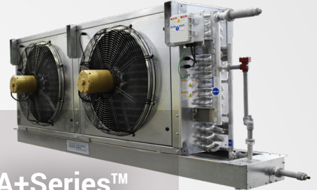
A+Series™ Air Coolers