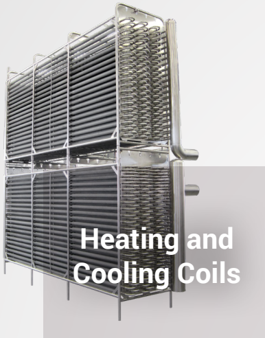
Heating and Cooling Coils