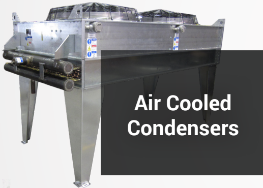
Air Cooled Condensers