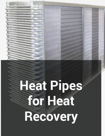
Heat Pipes for Heat Recovery