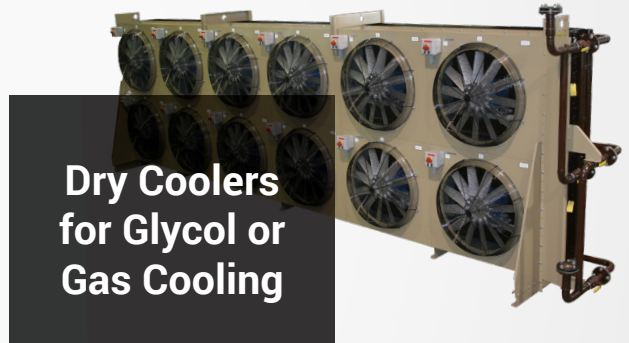
Dry Coolers for Glycol or Gas Cooling