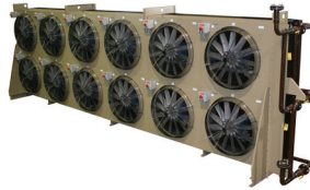
Dry Coolers for Glycol or Gas Cooling