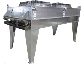
Air Cooled Condensers

CE(PED) Certification, ASME Sec. VIII, Canadian Registration Number, UL508, Canadian Standards Association