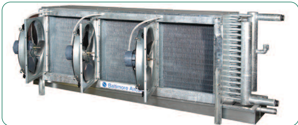
Swing Away Fan

Finned reheat coils produce continuous dehumidification and reduce sweating by heating the air after it leaves the cooling coil section. The reheat section is separated from the cooling section by an air break. This break in the fins eliminates thermal conductance between the sections and prevents water from migrating to the reheat coil, reducing wasted artificial loads and providing better dehumidification. Contact your local BAC Representative for performance ratings and other information.