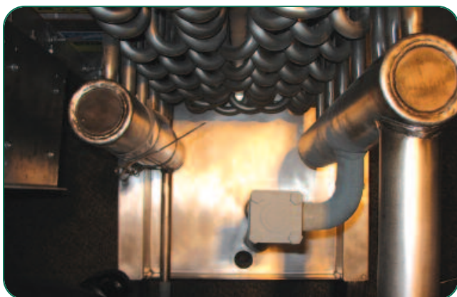
Interconnecting Piping Within Pan Profile

A corrosion resistant stainless steel pan coil, hydro-statically expanded into aluminum extrusions, delivers maximum heat transfer to an aluminum drain pan. Interconnecting piping is contained within the pan profile and the right-angle check valve is welded into place to prevent flanged connections. Side walls are at a 90° angle to the pan bottom for easy cleaning.