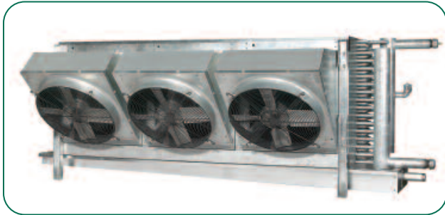
Forty-five Degree Down

On applicable models, air discharge alternatives include long throw adapters, forty-five degree (45°) down discharge, 90° down discharge (penthouse adapters), and fans selected for external static pressure (ESP). 45° and penthouse options feature heavy-duty discharge housings that tilt the cast aluminum fans 45° down from the vertical plane. These housings ship installed for ease of installation. Access panels are provided on penthouse adapters to permit service access.